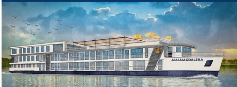
AmaMagdalena, artist rendering

Step aboard a world of unparalleled experiences and be warmly welcomed aboard our stunning newly designed AmaMagdalena , an intimate 60-passenger river cruise ship offering the luxury of space and sweeping views as you cruise Colombia's Magdalena River. This beautiful ship features a rejuvenating pool on the Sun Deck, a spacious fitness room, a Main Restaurant serving exquisite, regionally inspired Latin American cuisine and Western favorites and an intimate al fresco specialty dining experience. Stay tuned for more details coming soon!